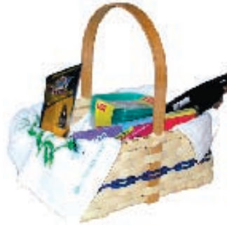
Example of a filled basket Positive Tomorrow's basket.